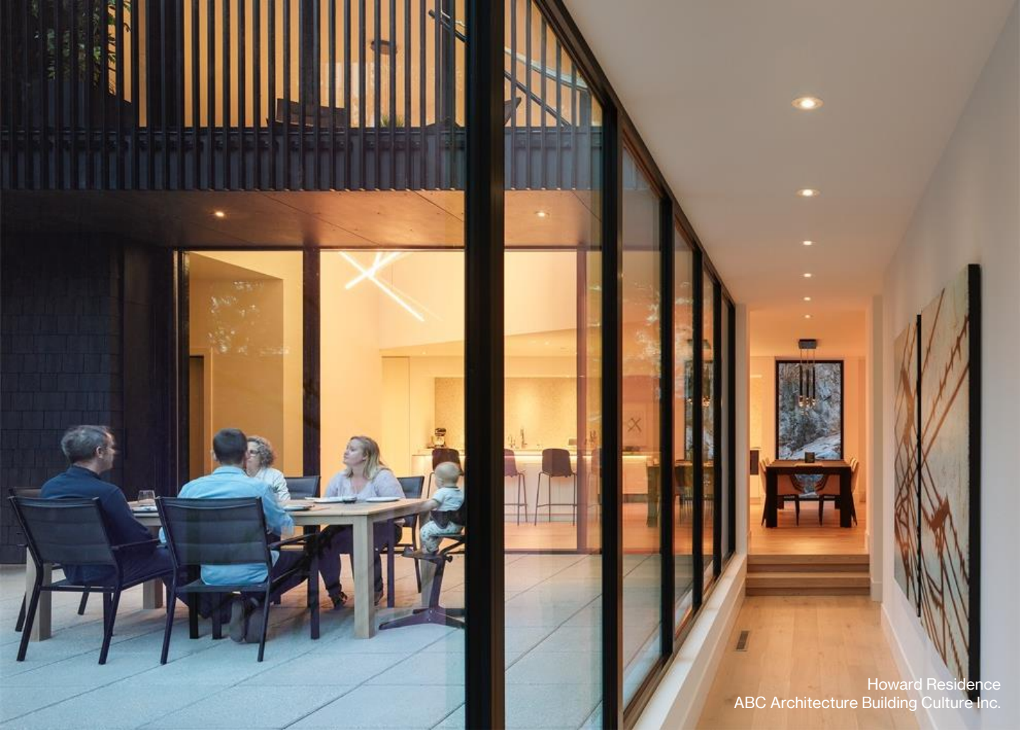
Howard Residence ABC Architecture Building Culture Inc.

“I wish the AFBC collaborated with other professional organizations to deliver advocacy-focused initiatives which increase the understanding and appreciation of the profession.”